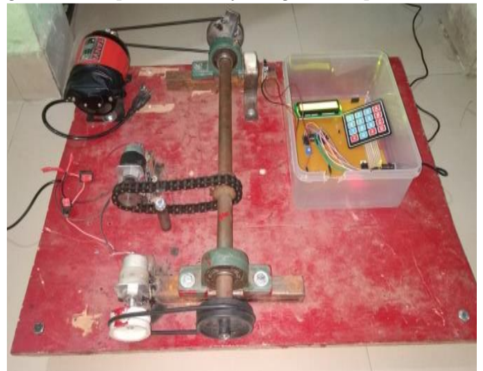
Fig. 2. The Torque measuring set up

OPERATING PROCEDURE: When we start the motor speed is fed to another shaft coupled with pulley. The torque sensor is mounted on along the shaft. The rotating movement is senses by torque sensor. Then this signal is transfer to circuit. Torque circuit displays torque as well as shaft diameter according to motor rpm..'ON' Thus we get direct torque of motor by using this setup.